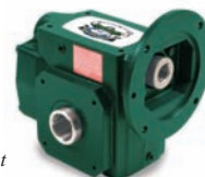
High Efficiency Right Angle Gear Reducer

“We convert power into motion to help the world run more efficiently.”