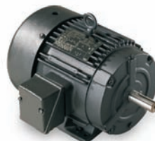
SyMAX™ Permanent Magnet Motor