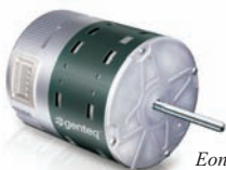
Eon™ HVAC Motor