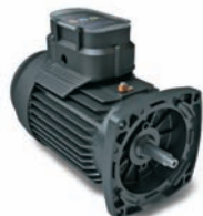
imPower™ Pump Motor